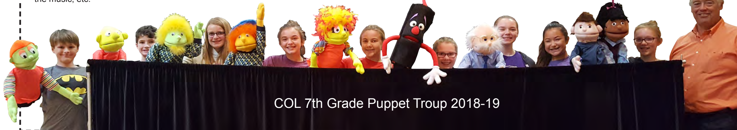
COL 7th Grade Puppet Troup 2018-19