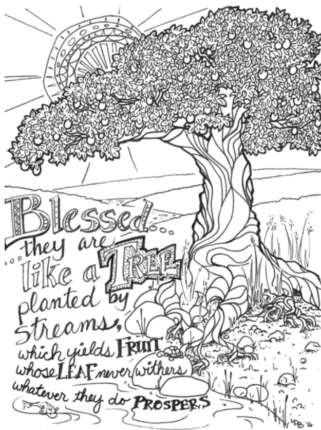
Blessed is the One