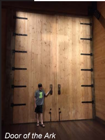
Door of the Ark