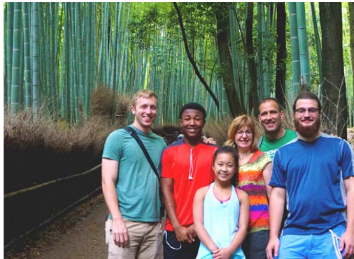
Family photo: The Bamboo Forest in Kyoto Japan.