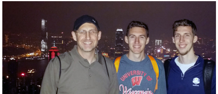
Photo: Recent trip to China